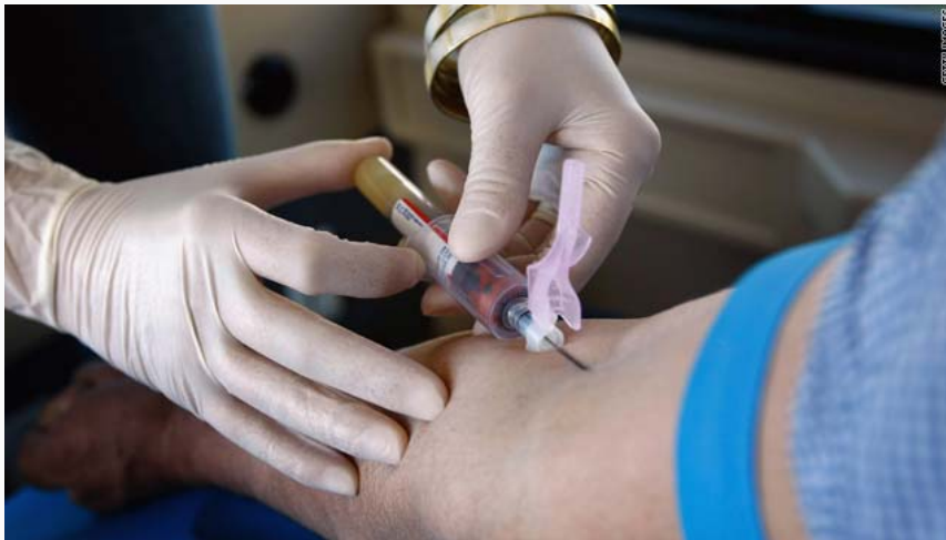
With a blood test, doctors may one day treat rheumatoid arthritis before it starts to take a toll on the patient.

Mixx Facebook Twitter Share Email Save Print